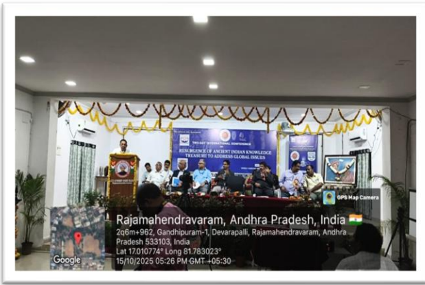
Rajamahendravaram, Andhra Pradesh, India 2q6m+962, Gandhipuram-1,Devarapalli, Rajamahendravaram, Andhra Pradesh 533103, India Lat 17.010774° Long 81.783023° 15/10/2025 05:26 PM GMT +05:30